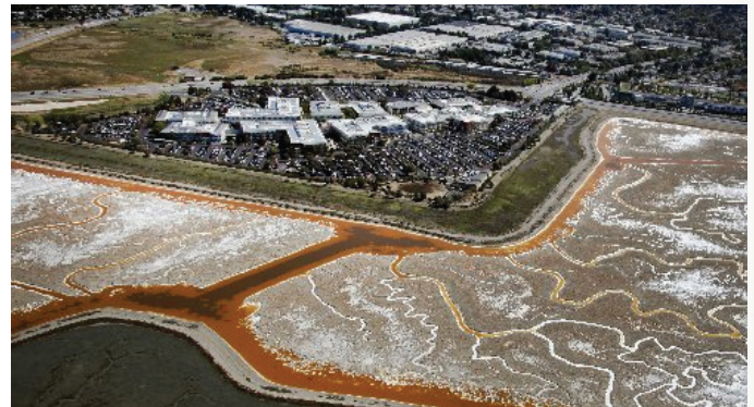
The Facebook campus sits next to the Menlo Park Baylands amid the rich colors of the drying mud flats in Ravenswood Slough in this aerial view taken Wednesday afternoon, Sept. 2, 2015, in Menlo Park, Calif.

It would be administered by the San Francisco Bay Restoration Authority, an agency created by state law in 2008 to restore wetlands and wildlife habitat in the bay and along the shoreline.